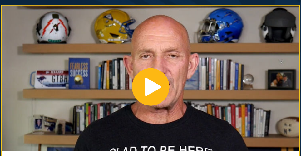
Top 5 Reasons to Hire Gucci!